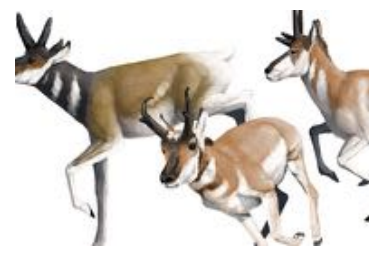
Tule Springs Pronghorn > ARTICLE